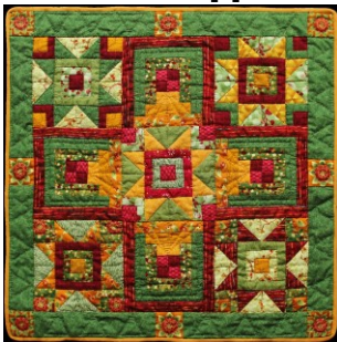
Holiday Star Table Topper