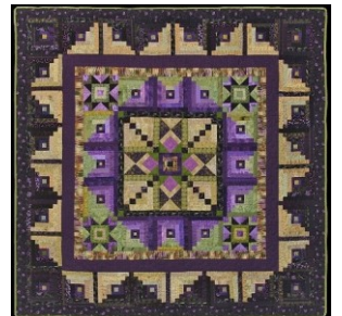
Five Star Combo