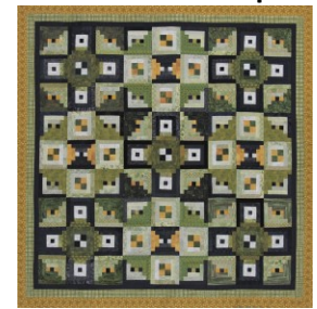
In and Out - Top