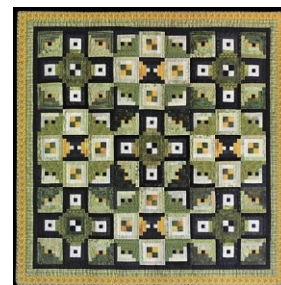
In and Out