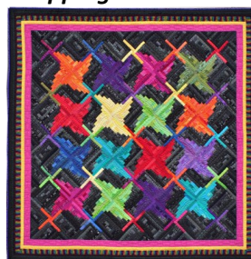
Stepping Out in Color