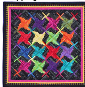
Stepping Out in Color