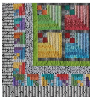
Soft Set detail