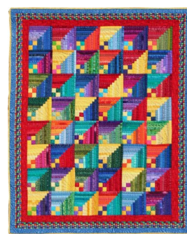
Offset Four Patch in Color