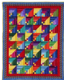
Offset Four Patch in Color