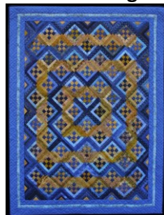
Nine Patch in Log Cabin