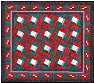
Cabins in the Snow