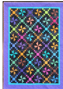
Turnstiles with Cornerstones