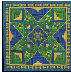
Center Star Expo